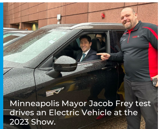
Minneapolis Mayor Jacob Frey test drives an Electric Vehicle at the 2023 Show.

Over 4,200 EV test drives were taken at the Show in 2023